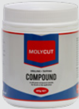
COMPOUND 400g Tub - M400 2kg - M401 & 65g Tube - M402