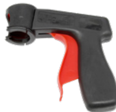
Molytec Aerosol Trigger

Molytec Aerosol Trigger enables more control for a smooth, professional finish. Includes a 4-finger trigger to minimise fatigue. Features include: