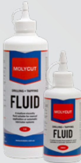
FLUID 250ml Bottle - M410 1L bottle - M412