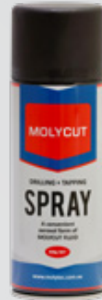
SPRAY 400g Aerosol - M420

MOLYCUT is a range of high-performance lubricants designed for severe metal working operations such as drilling, reaming and tapping. They are highly concentrated mixtures of lubricity and reactive extreme-pressure and anti-wear additives. All of the products in the range provide excellent surface finish to components and protect tooling from wear and damage.