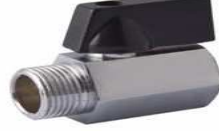
3831 - Brass Mini Ballvalve M/F

Chrome plated brass bodied 2 way ball valve ideal for line isolation, gauge cocks and other manual operations. 150 PSI. Size 1/8" to 3/4" BSP Male/Female.