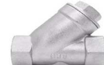
1790 - Stainless Y-Strainer F/F

Y Strainers are designed to protect piping systems and components from damage caused by dirt or debris in flowing liquids or gases. 800 PSI W.O.G.. Size 1/4" to 4" BSP.