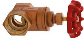
920 - Brass Gatevalve F/F

Gate valves are often used when minimum pressure loss and a free bore is needed. Gate valves are designed for fully open or fully closed service. 200 PSI. Size 1/2" to 4" BSP.