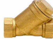
937 - Brass Y-Strainer F/F

Y Strainers are designed to protect piping system components from damage caused by dirt or debris in flowing liquids or gases. 260 PSI. Size 1/2" to 4" BSP.