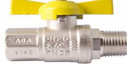
1721 - Brass Ballvalve T-Handle M/F

An A.G.A. approved T-Handle ballvalve for low to medium gas applications. Can also be used for oils and some chemicals. 580 PSI. Size 1/4" to 1" BSP Male/Female.