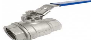
1760 - 2-Pce Stainless Steel Ballvalve F/F

316SS presents good corrosion resistance, strength and fabrication characteristics. 2-Piece with lockable lever. 1000 PSI W.O.G. Temperature -20C to 180C. Size 1/4" to 4" BSP.