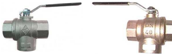
Bottom Entry Brass 3-Way Ballvalve

L-Port valves have a ball that joins two adjacent ports. They are used to direct flow between the centre and one of two side ports.