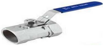
1775 - 1-Pce Stainless Steel Ballvalve F/F

316SS 1-piece ballvalve, reduced bore with lockable lever. Temperature range of -20C to 180C. 1000 PSI W.O.G. Size 1/4" to 3" BSP.