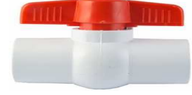
915 - PVC Full Flow Ballvalve F/F

General purpose BSP threaded PVC ballvalve used in water pumping for residential, industrial and agriculture. 200 PSI. Size 1/2" to 4" BSP Female/Female.