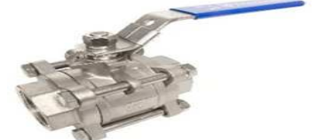
1750 - 3-Pce Stainless Steel Ballvalve F/F

316SS presents good corrosion resistance, strength and fabrication characteristics. 3-Piece with lockable lever. 1000 PSI W.O.G. Temperature -20C to 180C. Size 1/4" to 4" BSP.