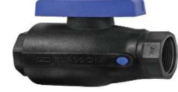
PLN3703 - Plasson Plastic Ballvalve F/F

Ideally suited for draining or sampling of water systems and monitoring systems. Entirely made of plastic is ideal for chemicals and potable water. 232 PSI. Size 1/2" to 2" BSP.