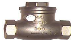
1785 - Stainless Swing Check F/F

Stainless steel swing check valve with hinged disc for 1-way flow of liquids. 200 PSI W.O.G. Size 1/4" to 4" BSP.