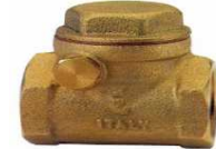
932 - Brass Swing Check F/F

Swing check valves have a hinged disc which swings into position, and can operate in either horizontal or vertical (upward flow) positions. 200 PSI. Size 1/2" to 4" BSP