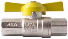
1720 - Brass Ballvalve T-Handle F/F

An A.G.A. approved T-Handle ballvalve for low to medium gas applications. Can also be used for oils and some chemicals. 580 PSI. Size 1/4" to 1" BSP Female/Female.