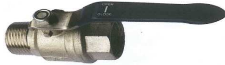
1706 - Brass Ballvalve with S/S Lever M/F

Nickel-plated brass ballvalve with a stainless steel lever for general purpose applications. Water, Oil, Chemicals and air. 290 PSI. Size 1/2" to 2" BSP Male/Female.