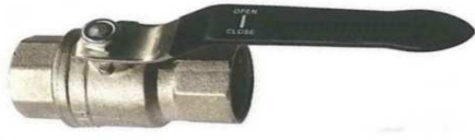
1705 - Brass Ballvalve with S/S Lever F/F

Nickel-plated brass ballvalve with a stainless steel lever for general purpose applications. Water, Oil, Chemicals and air. 290 PSI. Size 1/4" to 4" BSP Female/Female.