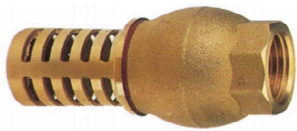
933 - Brass Footvalve

A foot valve is a check valve which is located at the inlet end of the suction line of a pump, allowing the pump to remain full of liquid even when not in service. Size 1/2" to 4".