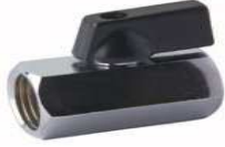
3830 - Brass Mini Ballvalve F/F

Chrome plated brass bodied 2 way ball valve ideal for line isolation, gauge cocks and other manual operations. 150 PSI. Size 1/8" to 3/4" BSP Female/Female.