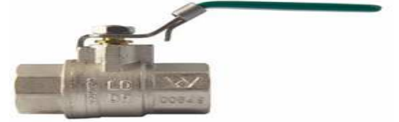
1705L - Brass Ballvalve Lockable Lever F/F

Nickel-plated brass ballvalve with a lockable lever for general purpose applications. Water, Oil, Chemicals and air. 290 PSI. Size 1/2" to 2" BSP Female/Female.