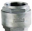
1795 - Stainless Spring Check F/F

Stainless steel spring check valve with stainless disc held by spring for 1-way flow of liquids in any mounted position. 200 PSI W.O.G. Temperature -20C to 170C. Size 1/4" to 2" BSP.