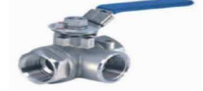
Side Entry Stainless Steel 3-Way Ballvalve

Stainless steel L-Port & T-Port 3-Way valves are designed to converge and divert the media flow in a piping system. 1000 PSI. Size 3/8" to 2" BSP.