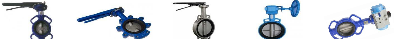
925 - Butterfly Valves

Butterfly valves are used for on-off or modulating services and are popular due to their light weight, small installation footprint, lower costs, quick operation and availability in very large sizes. These valves can be operated by handles, gears or automatic actuators. Cast iron body with stainless disc and shaft or fully stainless. 232 PSI. Size 2" to 6".