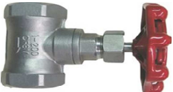
1781 - Stainless Gatevalve F/F

Stainless steel gatevalves are commonly used where high pressure/temperature and resistance to chemical is needed. 200 PSI W.O.G. Size 1/2" to 4" BSP.